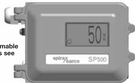
SP500 with front cover closed

Local regulation may restrict the use of this product below the conditions quoted. Limiting conditions refer to standard connections only. In the interests of development and improvement of the product, we reserve the right to change the specification.