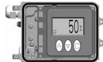
SP500 with front cover removed

For the programmable functions see page 2